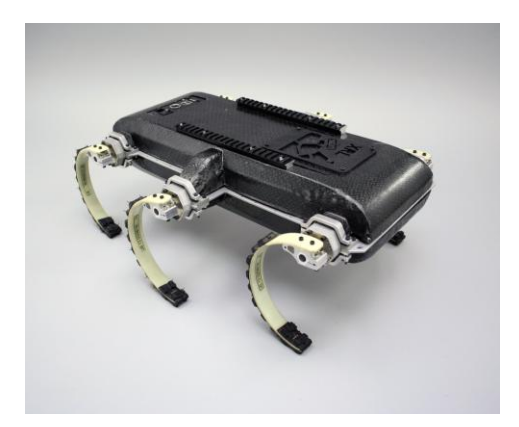
Image I: XRL hexapedal robot, created by University of Pennsylvania and STRIDe Lab