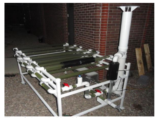
Figure 2 shows the Photobioreactor created last year. It incorporated sensors to monitor the microalgae growth. (Senior Design Project)

The 2012 team went in a different direction. They built a mini-photobioreactor at the FAMU-FSU COE, designed as a small-scale prototype of the one in Brazil. In addition, they designed and implemented concentration and mass flow rate sensors to determine the optimal