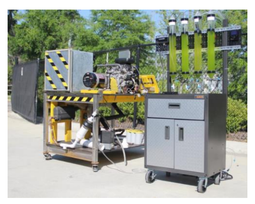
Figure 1 shows the Trigenerator System with Photobioreactor. This was completed by the 2011 Senior Design team. (Senior Design Project)

Starting in 2010, the combined team, consisting of a group at UFPR and a group at FAMU-FSU COE, developed a new way to monitor the effects of carbon dioxide on microalgae. The FAMU-FSU COE team built a bench-top airlift photobioreactor. The CO<sub>2</sub> was supplied though the bottom of the airlift tubes, rose through the algae, and exited out the top. The microalgae concentration was monitored by counting the cells under a microscope and the optimal amount of CO<sub>2</sub> to get the most cell growth was determined ( Senior Design Proposal ).