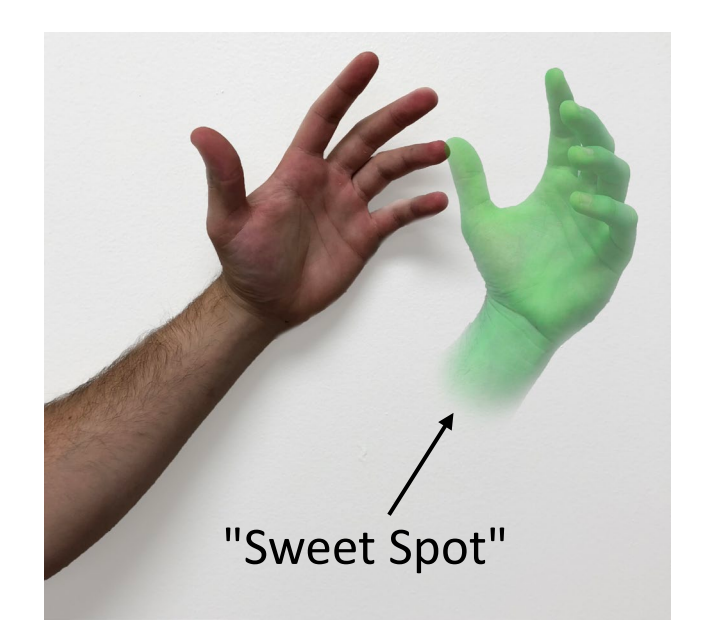
Figure 4: Example of indicating hand location and orientation