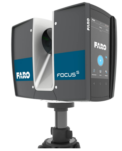
Figure 3: FARO Focus 3D Laser Scanner