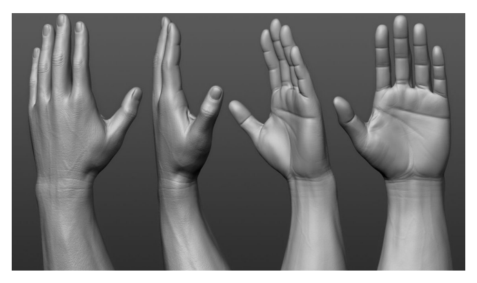
Figure 1: Anthropometric scan of various hand orientations

The objective of this project is to provide a user interface for participants in a 3D body scan environment to improve the quality of the scan and reduce the amount of instructions given by the scan technician.