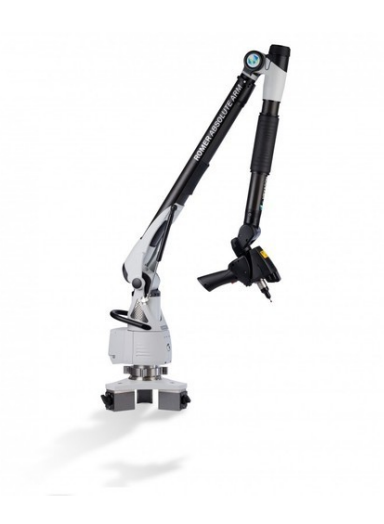
Figure 2: Romer Arm 3D Laser Scanner