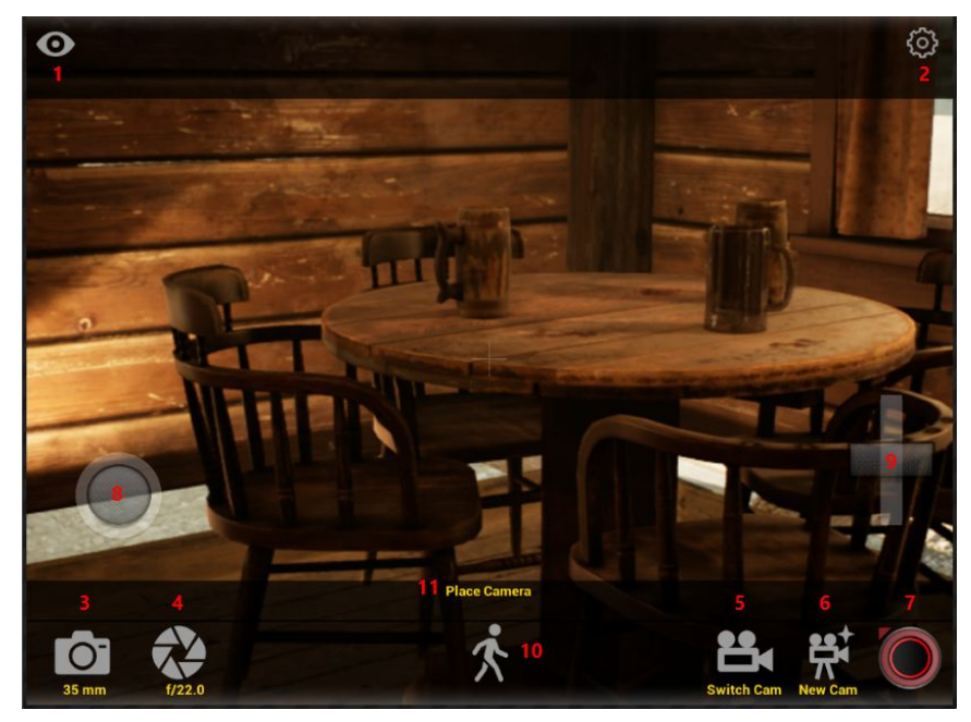
Mode 1: Place Camera

Place Camera Mode: This mode allows the user to freely place a camera anywhere in the scene using the controls and the place camera button. This is the initial setting when the controller is started.