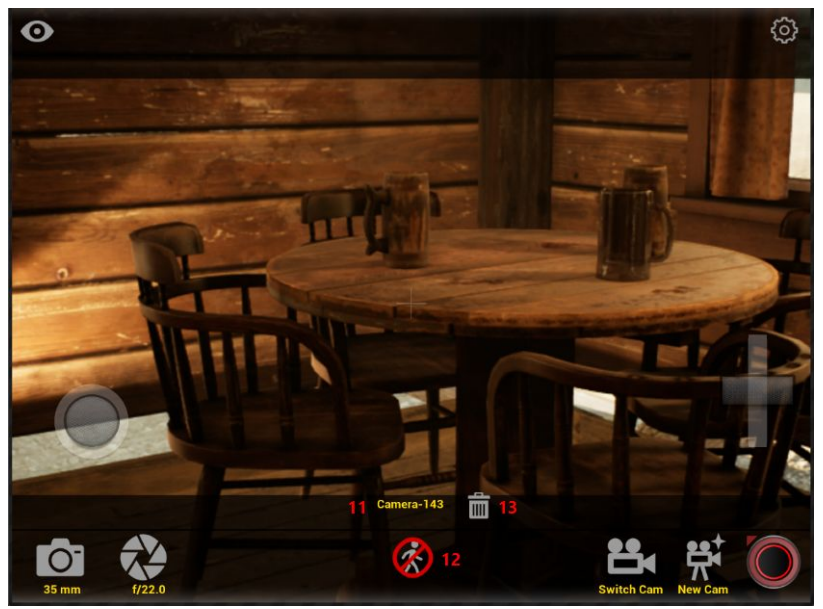
Mode 2: Change Camera

Switch Camera Mode: This mode is activated by pressing the "Switch Cam" button. When in this mode, the rotation controlled by moving the iPad is locked. The user is also able to delete the current camera location..